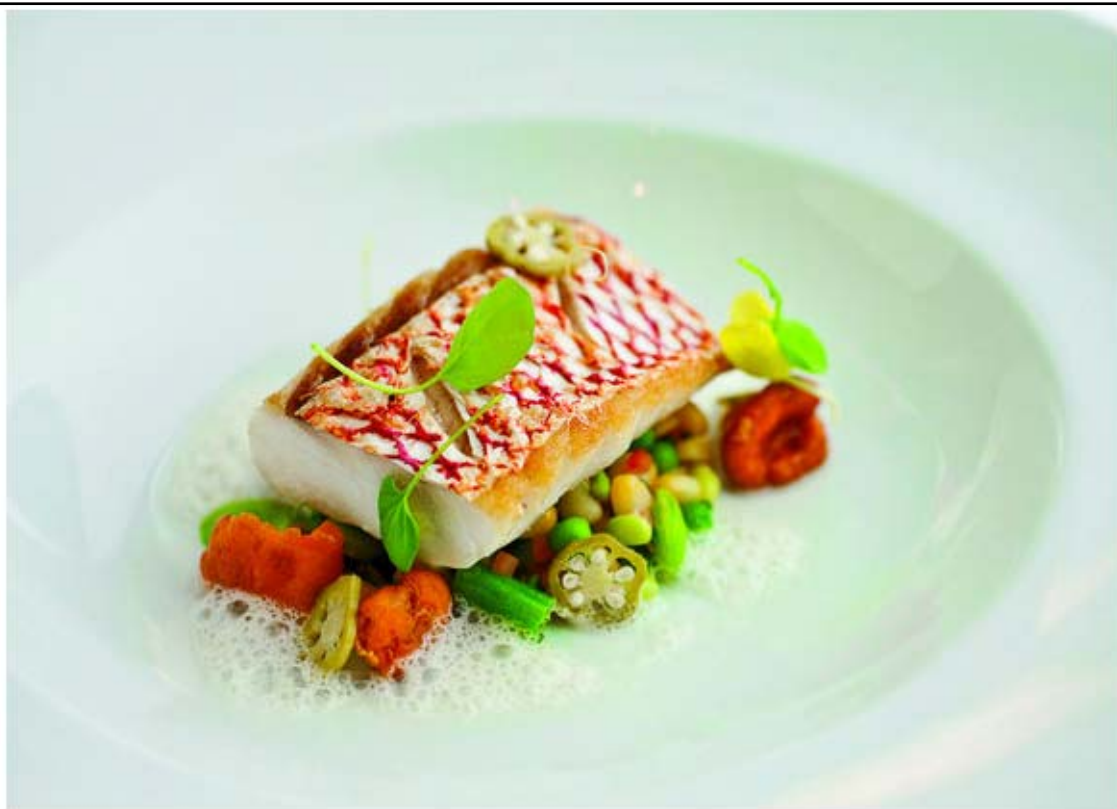
Local Red Snapper, Succotash, Chanterelles, Okra and Smoked Ham Hock Broth at Herons restaurant.