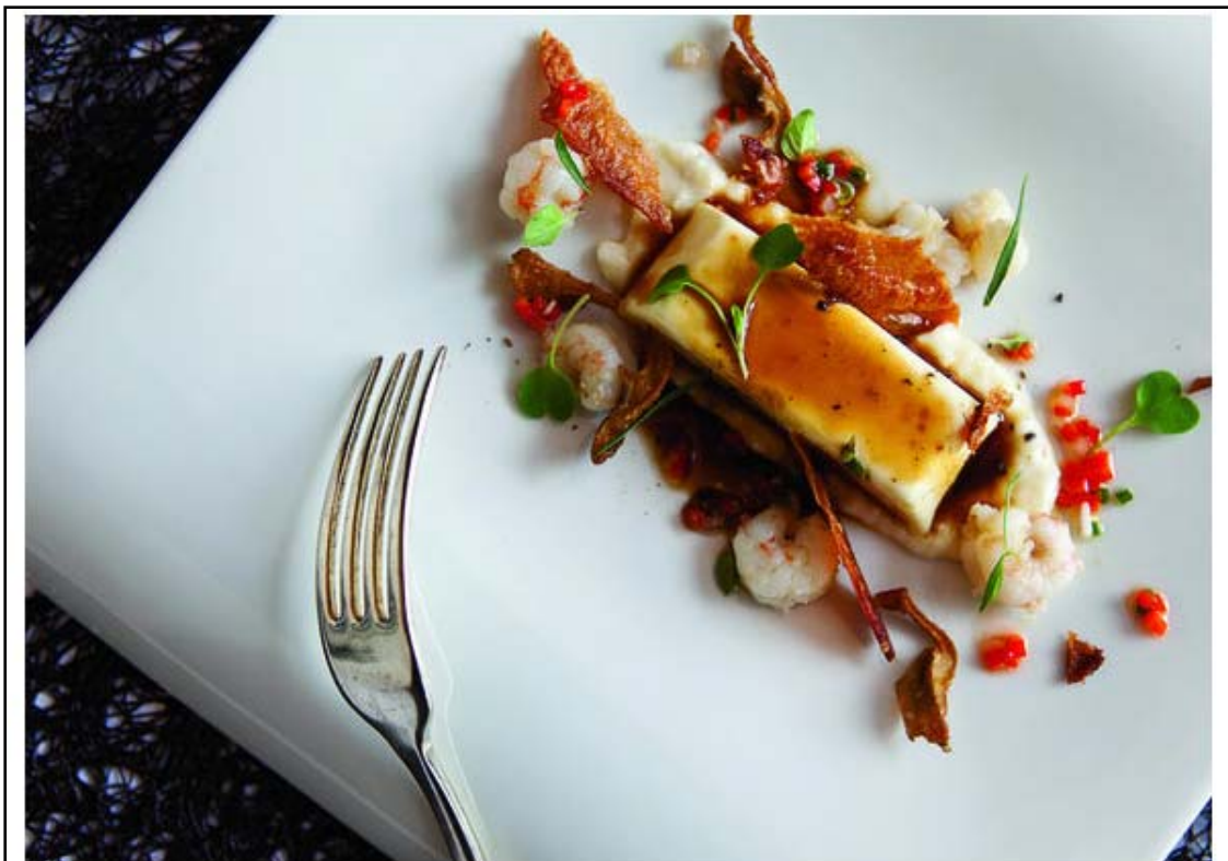
Butter Poached Rock Shrimp, Grits Custard, Chicken "Gravy" and Pickled Pepper Relish at Herons, the award-winning restaurant at The Umstead.